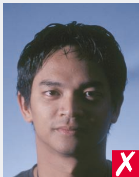
shadows across face