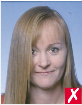
hair across eyes