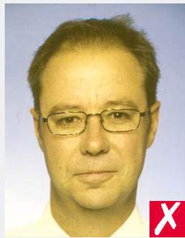
unnatural skin tones