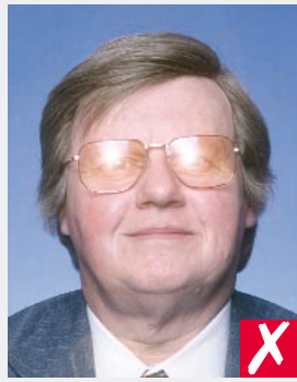
flash reflection on lenses