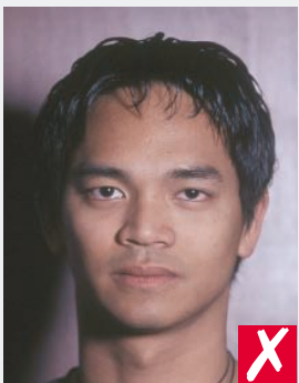
shadows behind head