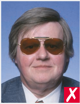
dark tinted lenses