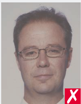
washed out colour