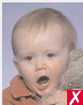
mouth open and toy too close to face