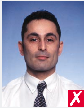
too far away