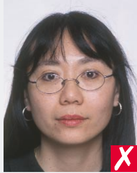
frames covering eyes