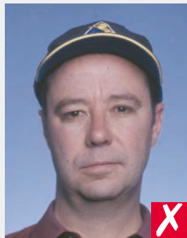
wearing a cap