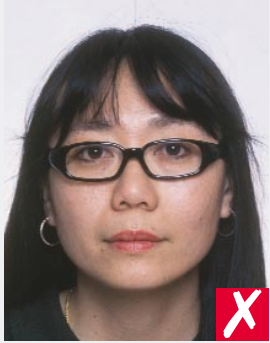
frames too heavy