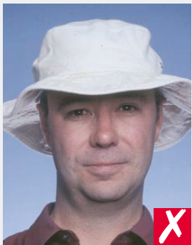
wearing a hat