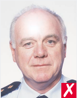
flash reflection on skin