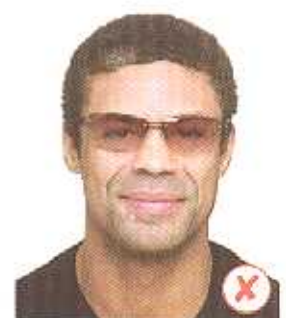
Dark tinted glasses