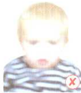
Blurred or too light