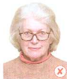
Frames covering eyes

Please note photographs become part of the official records of the UKPS and will not be returned. Photographs with a copyright warning attached will not be accepted. For example, school photographs.