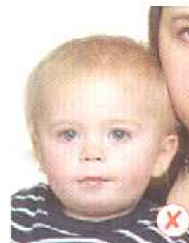
Shows another person